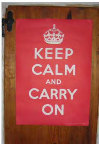
The Festival watchwords